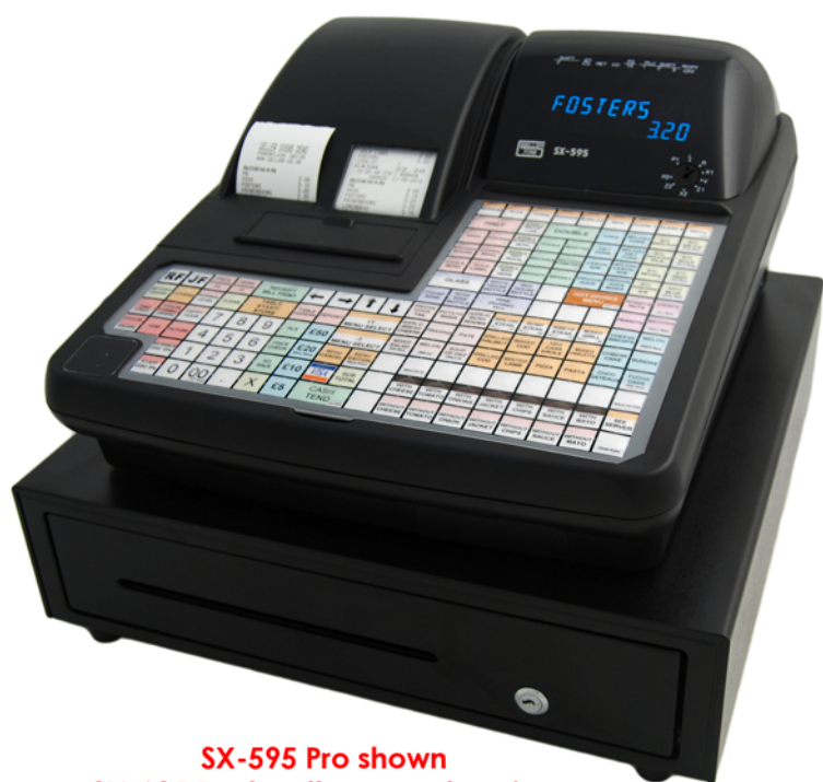
SX-595 Pro shown SX-695 Pro has the same housing